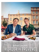
Murder in Provence