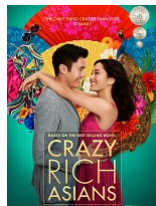
Crazy Rich Asians