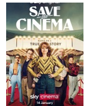
Save the Cinema