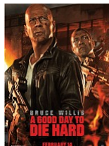
A Good Day To Die Hard