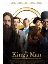
The King's Man