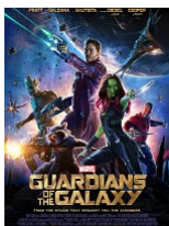
Guardians Of The Galaxy