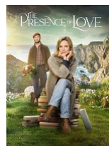
Presence of Love