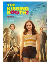
The Kissing Booth 2