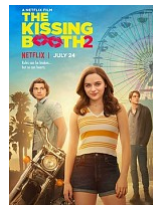
The Kissing Booth 2