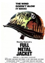
Full Metal Jacket