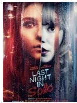
Last Night in Soho