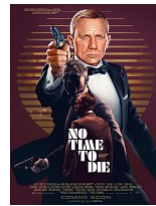
No Time to Die