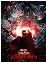
Doctor Strange in the Multiverse of Madness