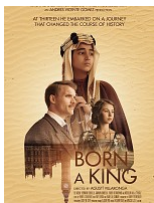
Born a King