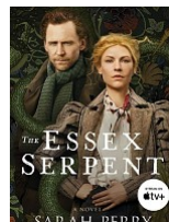
The Essex Serpent