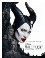
Maleficent: Mistress of Evil