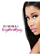
The Night is Still Young