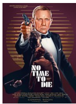
No Time to Die