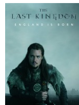
The Last Kingdom