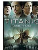
Titanic: Blood and Steel