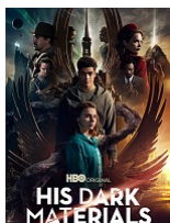
His Dark Materials