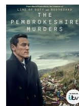
The Pembroke Murders