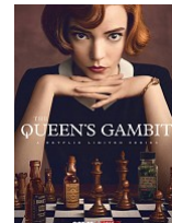
The Queen's Gambit