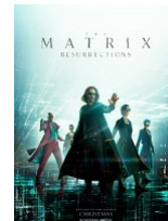
The Matrix Resurrections