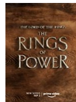
The Lord of the Rings: The Rings of Power