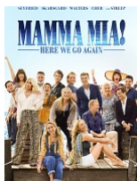
Mamma Mia! Here We Go Again