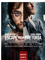
Escape From Pretoria