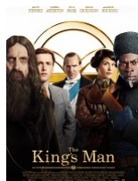
The King's Man