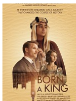
Born a King