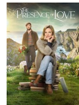
Presence of Love