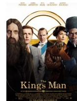
The King's Man