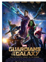
Guardians Of The Galaxy