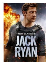
Tom Clancy's Jack Ryan