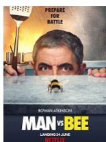
Man Vs Bee