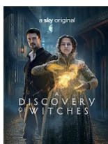
A Discovery of Witches