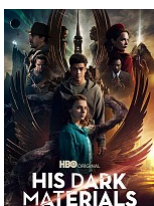
His Dark Materials