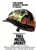
Full Metal Jacket