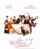
Four Weddings and a Funeral