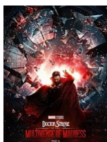
Doctor Strange in the Multiverse of Madness