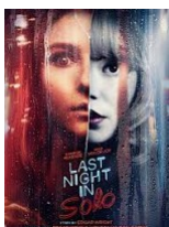
Last Night in Soho