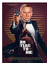
No Time to Die